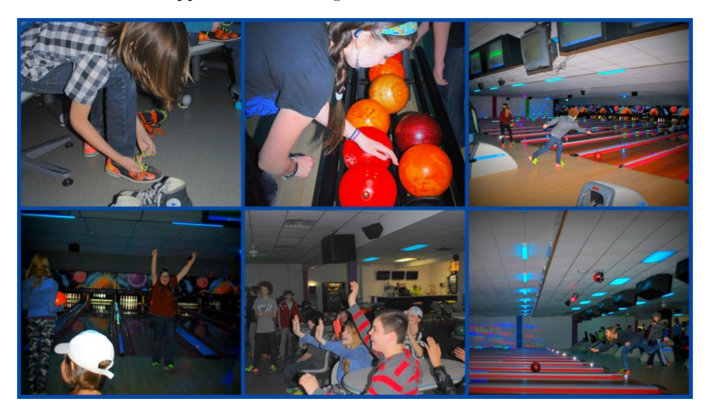
Upper Grade Bowling at Orchard Lanes

On Wednesday, February 18th the upper grades went bowling. We took busses up to Orchard Lane Bowling Alley in North Salt Lake. The staff at Orchard Lanes were so friendly. They turned on the black lights on and turned music up for us. Since the drinking fountain wasn't working the snack bar staff delivered pitchers of water and cups to each of our tables. It didn't even feel like we were on a school trip. It actually felt almost like a party! It would have been the perfect party if the snack bar had been open. The first ten people who got strikes even received a family bowling passes for another visit. Most kids bowled two or three games. What a fun way to spend a Wednesday morning.